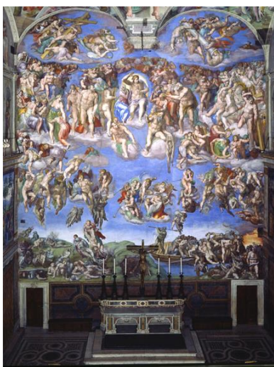
Michelangelo's Last Judgement